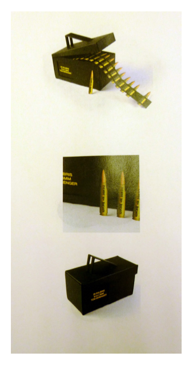
Image 3: Experimental exlibris study designed by Stefan Silberfeld, 80x13 mm, 2008