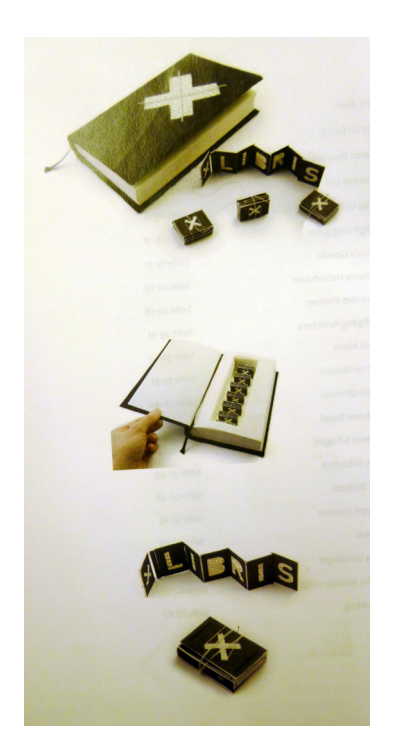
Image 1: Experimental ex-libris work by Felix Auer, 150x35 mm, 2008