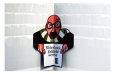
Image 4: RExperimental ex-libris work designed by Rastco Ciric, 2014

The pop-up ex-libris is a good example of the ex-libris designed by Rastco Ciric for the german 'Exlibriswereld' magazine. (Image 4). When the book is opened, the illustration of the man in the ex-libris design gives the impression that he is reading his blue book and is looking at us through a small hole on the cover of his book. When this blue book is bent down, the text 'Bibliotheek Exlibriswereld' appears. He also states in his article that the first pop-up ex-libris design was made in 1988 by Juan Carlo Franco on behalf of Benoit Junod. (Ciric, 2014: 2)