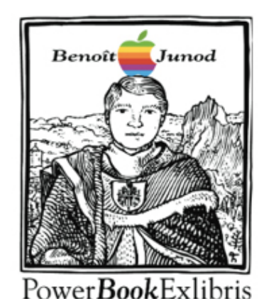
Image 5: Rastco Ciric tarafından tasarlanmış deneysel ekslibris çalışması, 2014

A well-known animated ex-libris design was made by artist Rastco Ciric. As seen on "Image 6" in Rastco Ciric's ex-libris, when the two pieces of paper stacked on top of each other are flipped quickly, the menacing teeth of the second image appear. It is clear that the artist designed this threatening image as a precaution against book thieves.