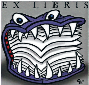
Image 6: Experimental ex-libris work designed by Rastco Ciric 2014

© 2019 EX-LIBRIST Part 10 - December 2019, Laratte, "Experimental Ex-libris and New Approaches"